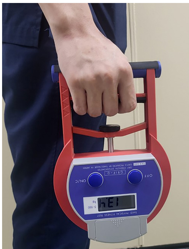
Fig. 2. A handgrip strength test using a handgrip dynamometer. Low muscle strength is defined as a handgrip strength of < 28 kg for men and < 18 kg for women.

Gait or walking speed is widely used for assessing the functional performance of sarcopenia. A slow gait speed has been associated with an increased risk of sarcopenia, disability, and adverse health outcomes. A commonly used walking speed test is called the 6-meter usual walking speed test, which uses a stopwatch or electronic