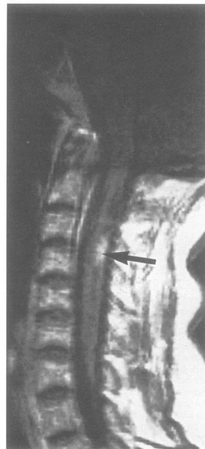
(B) Sagittal T1 weighted image after administration of 15 ml of contrast agent. A nodular contrast enhancing lesion is present in the posterior cervical cord (arrow).

old woman presented with tickling sensations running down her back when bending the head. Five months before she had first noticed numbness of her feet which slowly ascended to the level of her nipples. During the past six months she had lost 7 kg in weight.