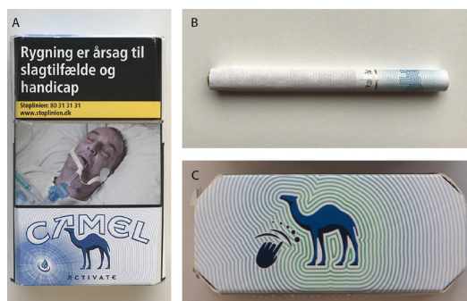
Figure 3 Examples of post-ban design insinuating menthol characteristics. (A) Camel packaging with the brand descriptor 'Activate' and an illustration containing a mint-like leaf. (B) Camel Activate cigarette stick with blue circles on the filter insinuating click-function. (C) Camel Activate package with an illustration guiding the consumer to rub on the lid to release a menthol aroma.

The products identified and analysed in this study reveal that tobacco companies use a variety of strategies to undermine the menthol ban. Some of these tactics are also observable in other countries. In the UK, gaps in the EU menthol ban were