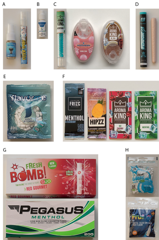
Figure 1 Examples of tobacco flavour accessories marketed in Denmark. (A) Menthol filter sprays (Egogreen and Ottaman). (B) Menthol drops (Instahit). (C) Capsules with menthol, candy and soft drinks flavours (Aroma King and Hoffmann). (D) Menthol flavour stone (Flavor By Stone). (E) Loose mint filter tips for cigarettes with recessed filters (FlavorMe, King's Tobacco International). (F) Menthol and fruit flavour infusion cards (Frizz, Hipzz and Aroma King). (G) RYO cigarette tubes with fruit flavour (Fresh Bomb); RYO cigarette tubes with menthol flavour (Pegasus, Continental Tobacco Corporation). (H) RYO filter tips with menthol and fruit flavours (Fresh Bomb and Frutta). RYO, roll-your-own.

menthol flavour to certain cigarette brand variants. In response, JTI stated that the continued use of menthol in their products was in full compliance with the law and that the products did not have a clearly prominent smell or taste of menthol. 6