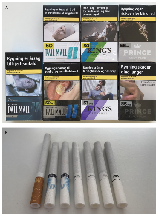
Figure 2 Cigarettes with recessed filters and their menthol characteristics. (A) Pall Mall Ultramarine and King's Ultramarine (online store description: '... gives a cooling effect and a fresh feeling ...'), Prince Grey Plus, Pall Mall Balance, Pall Mall Experience, King's Purple Plus and Prince Black Plus (replacement packages for the former menthol cigarettes: Prince Green Boost, Pall Mall Green, Pall Mall Double Capsule, King's Double Crush and Prince Double Click). (B) The design of the cigarette sticks with recessed filters.

Prior to the menthol ban, two variants of cigarillos with menthol flavour were registered in Denmark. 7 Both variants resemble cigarettes in size and thickness, and one variant has a click-filter. From 2019 to 2020, the sale of cigarillos and cigars increased by 7%, 8 which may be associated with the introduction of these menthol variants. Tobacco companies and retailers also marketed menthol pipe tobacco and electronic cigarettes with menthol flavour as alternatives to menthol cigarettes, 9 10 and Phillip Morris International (PMI) promoted mentholated