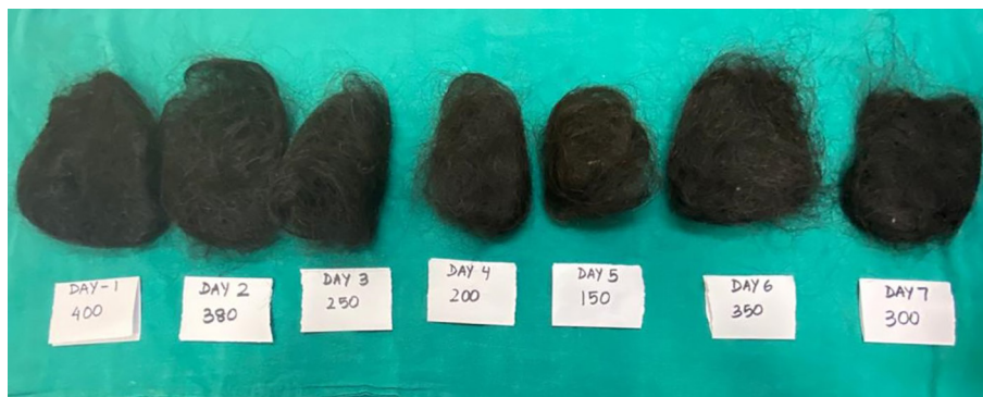
Figure 1. Daily hair count of seven days from a patient with severe degree of diffuse hair loss.