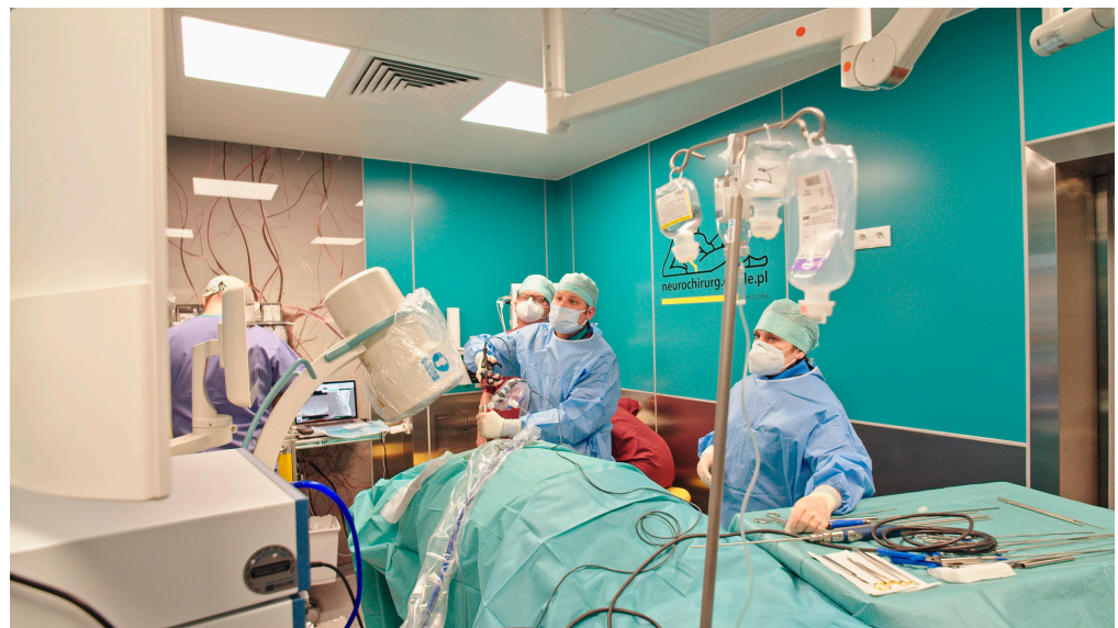
Figure 1. Real-time view of the treatment room during an endoscopic spinal surgery.

While our center's treatment room is not legally classified as a surgical operating room, it has been registered and functions as a treatment room. Importantly, it is equipped with state-of-the-art medical equipment that is comparable to, or even superior to, what is available in traditional hospital operating rooms (Figure 1). Notably, this facility has been authorized by the Regional Epidemiological Station to perform specific procedures related to minimally invasive spine surgery.