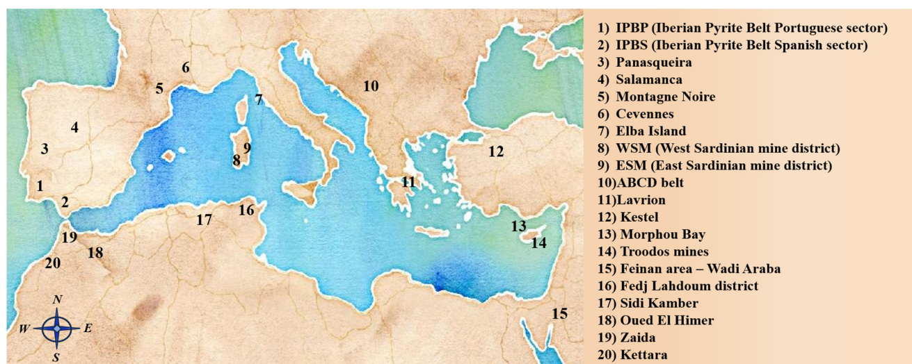
Figure 1. Main metallic mine ‘macro areas’ mentioned throughout the text. Authors’ creation.

The majority of metal mining sites, distributed from the western to the eastern Mediterranean Basin, are related to sulphide ores (Figure 1). Spain and Portugal have had an important mining activity, and the main ores are in the Iberian Pyrite Belt (IPB), one of the biggest sulphide ores of western Europe [34]. São Domingos, Caveira, Rosalgar, Rio Tinto, and Aznalcóllar are some of the most important mining sites in the IPB, some of which are now abandoned with few reclamations [35–37]. The area of Aznalcóllar (Seville) is of particular concern as, in 1998, a mine dump crumbled in the Guadiamar river, spilling four million m 3 of polluted materials rich in metal(loid)s into its course [38,39] and compromising the soils for a surface of 55 km 2 [40]. An emergency clean-up of the sludge and contaminated topsoil was carried out, even if the underlying soils remained irreparably contaminated. Hence, the regional administration acquired these lands in order to begin a large phytomanagement action using Mediterranean plant species [34].