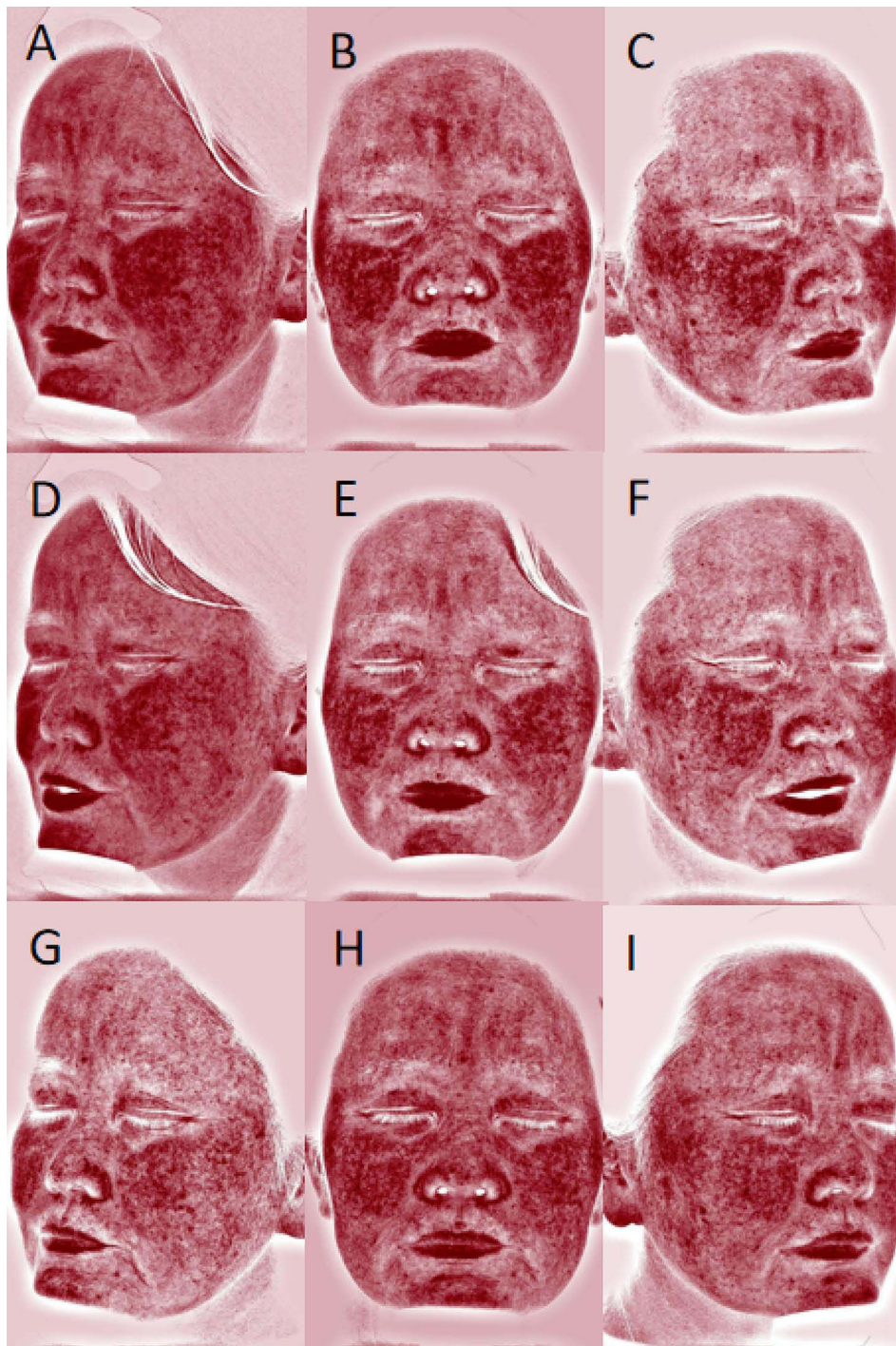
Figure 4 Images during clinical treatment with abrocitinib (VISIA). (A–C) Abrocitinib 100 mg daily treatment week 12; (D–F) Abrocitinib 100 mg every other day treatment week 16; (G–I) Abrocitinib 100 mg twice weekly treatment week 20.

immunomodulatory effects by inhibiting JAK phosphorylation to reduce downstream inflammatory cytokine synthesis, inhibit T-cell proliferation, and ultimately block the synthesis and secretion of various inflammatory cytokines. 11