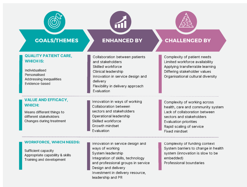
Figure 2. Summary of learning.

Throughout setup and first year of service delivery, several challenges and learning opportunities presented themselves to the Active Together team. These are discussed here and summarised in Figure 2.