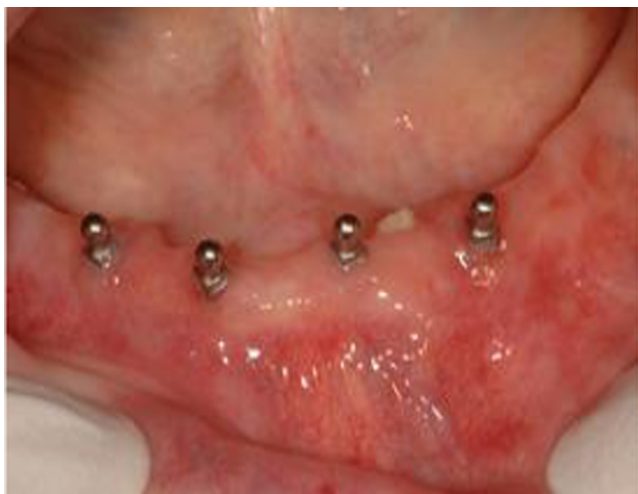
FIGURE 1 The patient presented with an atrophic edentulous ridge that was treated with 2.5-mm-diameter mini-implants and immediately loaded.

Atrophic bone in the maxilla may not be dense enough to resist occlusal loading. However, there can be very dense osseous islands that can provide appropriate implant support. Thus, it is incumbent on the clinician to evaluate preoperatively the quality of the maxillary bone. Hounsfield units (HU) on cone beam computerized tomographs can give an indication of bone density, but HU is not completely reliable. 10 HU does provide an approximation of bone density. Intraoperative sensibility by the operator is the ultimate test for bone density. Nonetheless, density is not uniform in bone. Thus, one not-so-dense site may be just a millimeter or two away from a very dense osseous site. 10 This means that if an implant is placed at a less dense site, the surgeon may