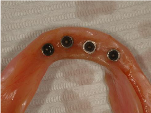
FIGURE 2 The patient was treated with small-diameter, mini-implants to retain the mandibular complete denture.