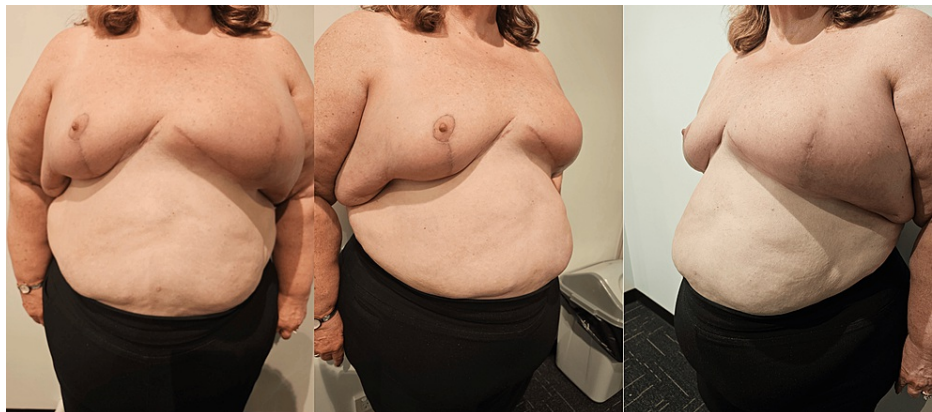
FIGURE 5: Progress photos at two months post-operatively demonstrating ongoing good wound healing and preservation of symmetrical breast contours.