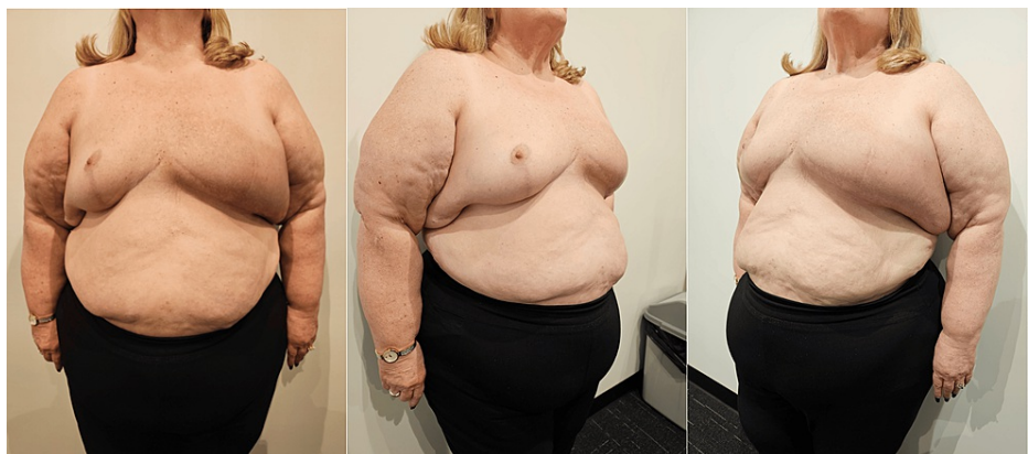
FIGURE 6: Progress photos at six months post-operatively demonstrating healed wounds and preservation of symmetrical breast contours.