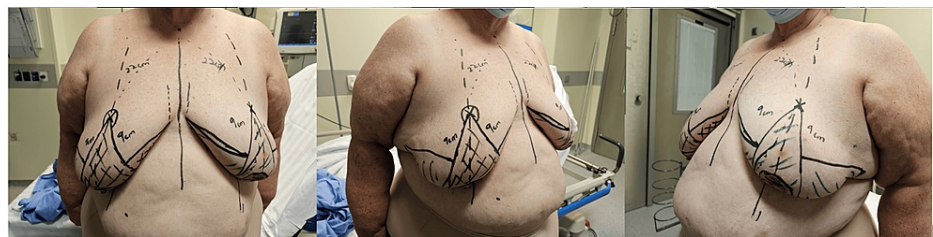
FIGURE 2: Pre-operative Wise pattern incision markings.

The apex of the reduction pattern is positioned along the breast meridian projecting forward from the level of the inframammary fold. Vertical limbs are then drawn at an 80-degree angle. The medial and lateral horizontal lines are then drawn.