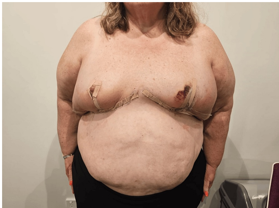
FIGURE 3: Immediate post-operative photo showing symmetrical breast contours.

The apex of the reduction pattern is positioned along the breast meridian projecting forward from the level of the inframammary fold. Vertical limbs are then drawn at an 80-degree angle. The medial and lateral horizontal lines are then drawn.