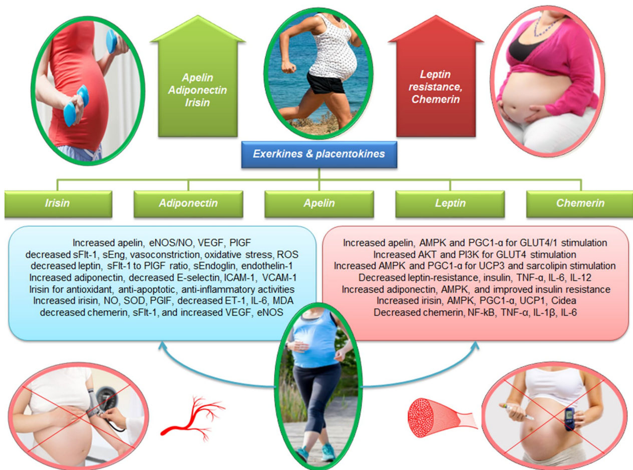
Fig. 3 Effects of exerkinases and placentokines on gestational diabetes and preeclampsia. Apelin and exercise increase AMPK, PI3k, and AKT1, leading to GLUT4, GLUT1, and PGC-1 \alpha stimulation in pregnant rats. This process then increases the expression of UCP3 and sarcolipin for thermogenesis. Acute exercise also increases VEGF mRNA via AMPK and, increases eNOS/NO production and decreases reactive oxygen species in placental vasculature. Decreased leptin induced by regular exercise during pregnancy is associated with increased serum concentration of PIGF and decreased sFlt-1, sEng, and endothelin-1. Exercise during pregnancy acts as an antioxidant and leads to a decrease in leptin, TNF- \alpha , IL-6, and IL-12 levels. Exercise also improves central sensitivity to leptin, which is known as the phenomenon of leptin sensitization. Higher levels of adiponectin are associated with greater physical activity, and AMPK activation through adiponectin is an important process for glucose and lipid metabolism. Increasing the concentration of adiponectin leads to the decrease of E-selectin, ICAM-1, VCAM-1, and suppression of vascular inflammation. In active women, irisin is slightly increased and directly improves muscle metabolism through AMPK activation and then stimulates PGC-1 \alpha , which in turn leads to increased mRNA expression of UCP1 and cidea, increased thermogenesis, and increased adipose tissue browning. Irisin also leads to a significant decrease in systolic blood pressure, diastolic blood pressure, ET-1, IL-6, and MDA and a significant increase in SOD, PGF, and NO in patients with preeclampsia. In the peripheral blood of gestational diabetes patients, the expression of chemerin is positively correlated with the inflammatory factors IL-6 and TNF- \alpha , while the level of chemerin decreases in the exercise + diet groups. Overexpression of chemerin through the CMKLR1 receptor in human trophoblasts leads to increased sFlt-1, decreased VEGF-A, and eNOS, which contributes to preeclampsia. On the other hand, 6 months of training reduces the level of chemerin significantly

(E-selectin, ICAM-1, VCAM-1), and suppression of vascular inflammation (Fig. 3). Increased adiponectin levels may be a compensatory feedback mechanism to counter the anti-angiogenic, and pro-atherogenic effects of severe preeclampsia, adiponectin resistance, and reduced inflammation.