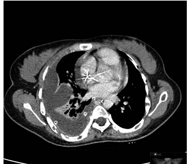
Figure 2. Axial computed tomography scan of the chest demonstrating severe right-sided pleural effusion and right lung collapse.

A multidisciplinary team meeting was arranged, and it was decided to conduct a lymphogram study, which confirmed systemic malformation of lymphatic vessels. Accordingly, the patient