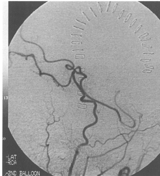
Figure 3 Conventional immediate postoperative selective DSA with similar projection to fig 2 for comparison.

seemed to contribute significantly to the distal middle cerebral artery branch filling (fig 2). The patent anastomosis has been confirmed on conventional angiography (fig 3).