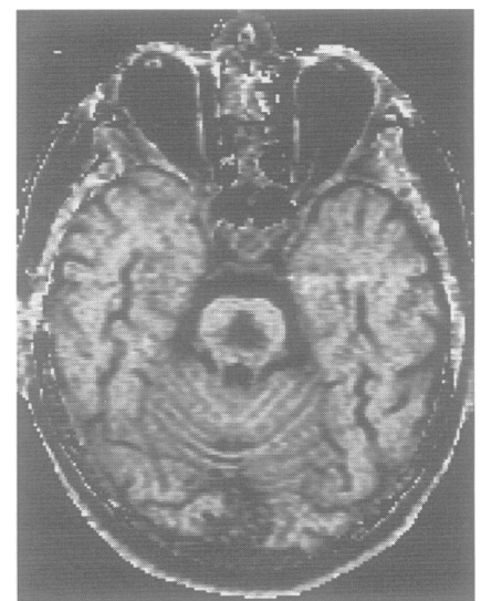
Figure 2 Calculated MTR image showing reduction of MTR in the pons, with preservation of signal in the surrounding rim.