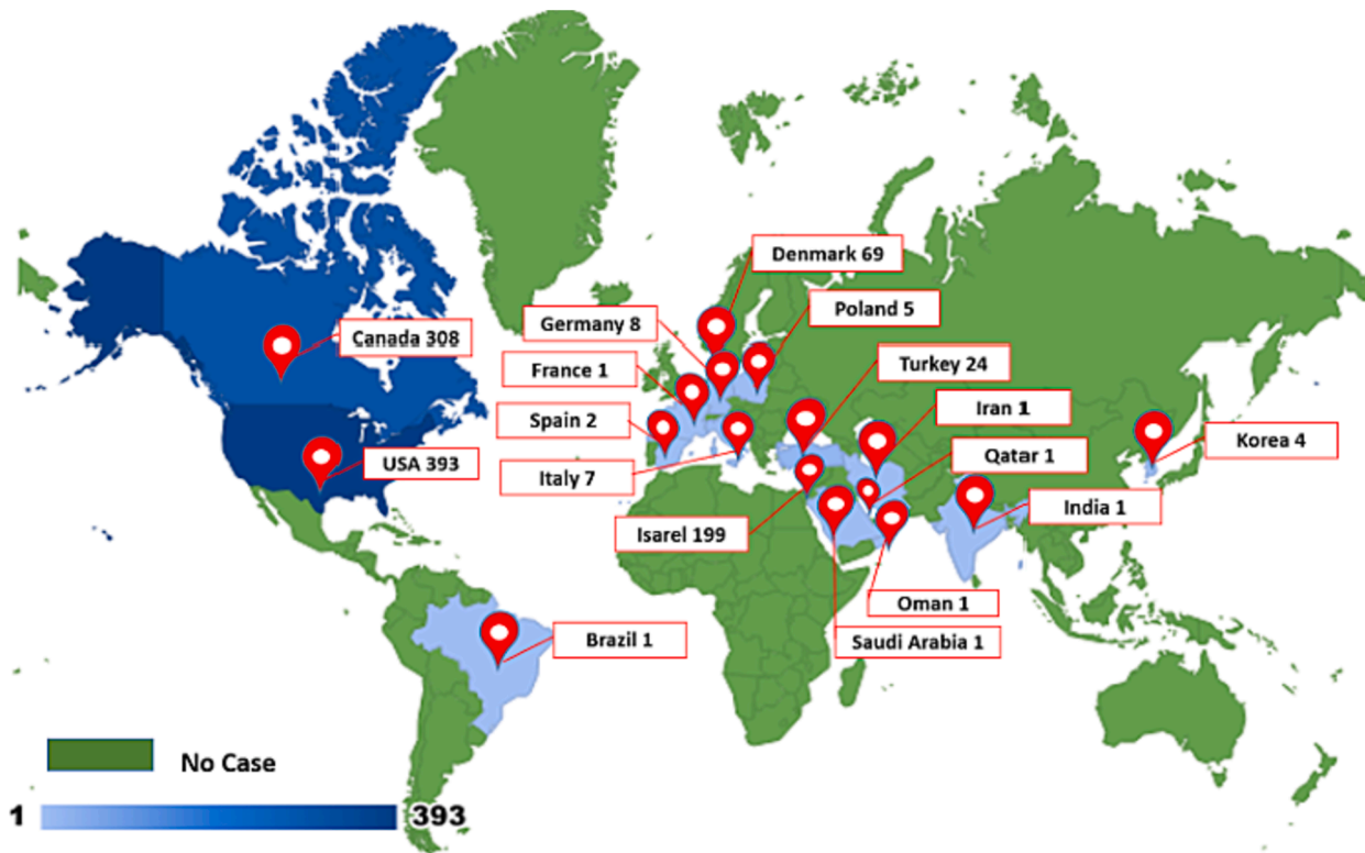
Fig. 3. Geographical Distribution of Cases of Myocarditis after Vaccination (Country, No of cases) based on the systematic literature search.