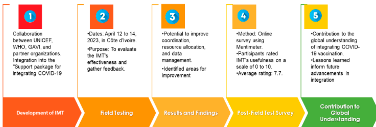
Figure 1. Flowchart provides a visual representation of the key phases and progression of the study, from its initiation to the dissemination of findings and lessons learned for future integration efforts.

Based on the evaluation of the process of implementation, the use of the IM tool, the result mapping, the survey, and the overall report of the workshop, it was possible to come up with a list of lessons learned from the whole exercise. The following aspects were detailed for enlightenment: participation, priority groups, collaboration, timing, technical support, innovation, and pillars for integration. All data analysis, with statistical evaluation, reporting and data visualization, was performed using Excel 5.0. The results were presented in tables, heat maps, and line graphs. The Ministry of Health supported the integration mapping tool pilot process as shown in Figure 1, including by providing official invitations. While no ethical clearance was required, participants consented to their experiences being documented and shared. Anonymized data were used solely for research and presented in aggregated form to protect privacy.