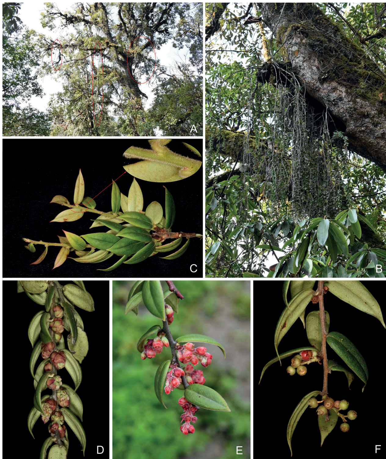
Figure 1. Vaccinium usneoides sp. nov. A habitat, the red ovals indicating this species B habit C leafy branches, the arrow showing the indumentum on young branchlets and leaf blades D flowering branchlets with young inflorescences E flowering branchlet F fruiting branchlet. A, B taken by Yi-Hua Tong C, F taken by Yong-jie Guo D taken by Ji-Dong Ya E taken by Ting Zhang.

× 0.9–1.8 cm, thickly leathery, adaxially more or less transversely wrinkled when dry, especially for young ones, abaxially with evenly distributed and caducous appressed black glandular trichomes, trichome base papillate, both sides pu-