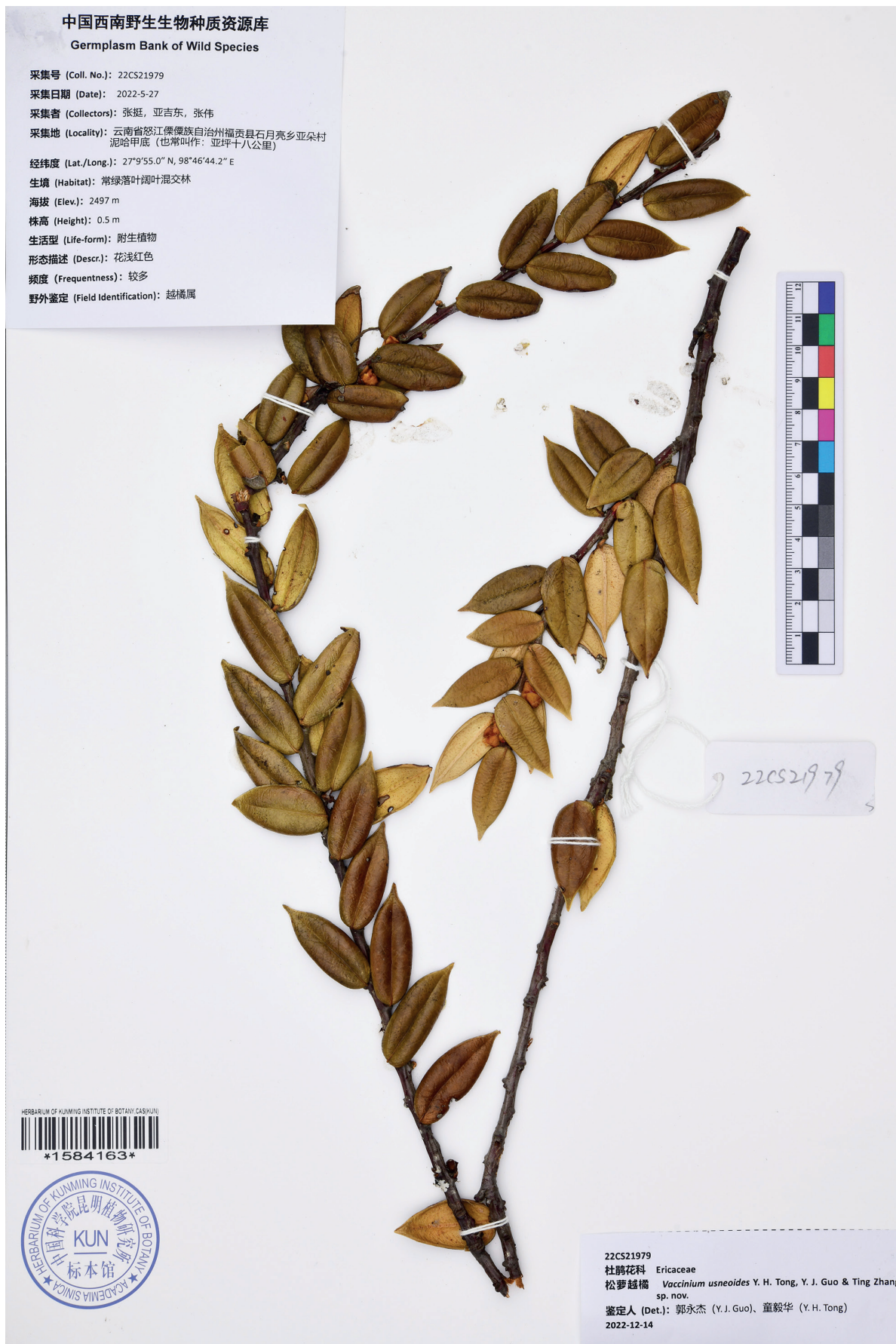
Figure 3. Holotype of Vaccinium usneoides (Ting Zhang, Ji-Dong Ya & Wei Zhang 22CS21979, KUN, barcode no. 1584163).