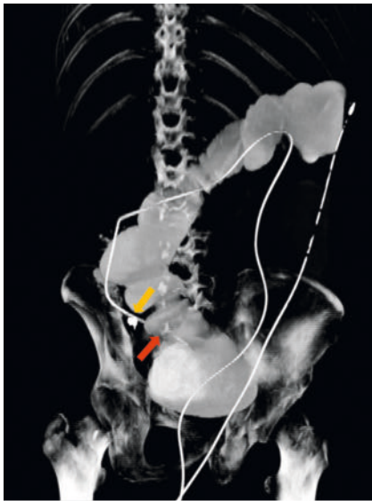
► Fig. 1 Computed tomography (CT). Approximately 200 mL of contrast agent was injected into the intestine through the colonic transendoscopic enteral tubing (TET) tube. Following a 10-minute ambulation, CT was conducted and displayed the entire TET tube, dilated distal ileum, and a segment of the proximal colon. The yellow arrow indicates clips fixed onto the intestinal wall. The red arrow highlights the TET tube passing through the stricture into the terminal ileum.