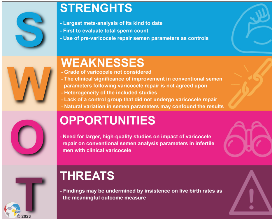
Fig. 2. Strengths, Weaknesses, Opportunities and Threats (SWOT) Analysis.

the control group. This approach has some drawbacks in terms of statistical methodology [381], potential of the placebo effect, non-blindness of the type of intervention e.g. , varicocelectomy, and it also lacks a control arm of patients that did not undergo varicocele repair. A proper control group is a key in establishing a cause-and-effect relationship of a certain variable [382] and testing the impact of an intervention on the outcome. However, this before-after analysis has the advantage of including all intervention groups, thus minimizing the number of studies excluded because of deficient data and increasing the number of patients available for analysis. The quality of the majority of the studies included in this meta-analysis is considered low due to factors such as poor study design, inadequate sample size, selective reporting, or high attrition bias (Table 3, 4). An ideal clinical trial to evaluate the impact of varicocele repair on male fertility outcomes would be to randomize a group of male with subfertility to varicocele repair or sham surgery and follow their outcomes over time. However, many ethical concerns surround such an approach and prevent its implementation. This explains the paucity of high-quality studies on the effects of varicocele repair and male fertility potential. In this regard, a meta-analysis of low-risk-of-bias RCTs would give the best QoE on the impact of varicocele re-