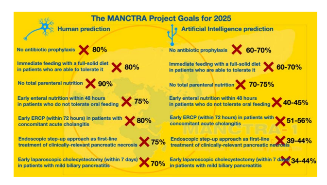
FIGURE 2. The MANCTRA project goals for 2025.

The monitoring of the application of the elements can be carried out considering a benchmark of \geq 50\% for the whole bundle and specific thresholds for every single element. The working group and the panel of experts have also elaborated forecasts on compliance with every single element of the bundle based on the potential for its dissemination and penetration into the clinical care practice (Fig. 2). For each bundle element, the panel of experts performed a literature review to highlight the levels of compliance reported in previous studies. The average compliance rate was taken as a reference, and +10% was applied to the final goal as a likely increase thanks to human effort. Within this context, the forecasts