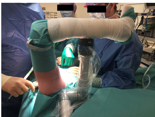
Figure 3 Trimano arm holder (Arthrex, Naples, FL, USA).

persistent NTOS (27,28). A TA approach enables a perfect exposition to perform a tenectomy of 3–5 cm of the pectoral minor muscle without the need for a separate incision.