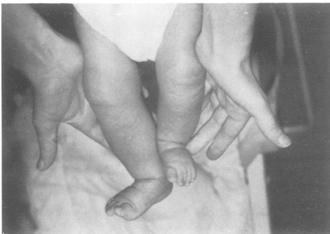
FIG 3 Limb asymmetry appears in 60% of patients. It is important to exclude congenital dislocation of the hips as a cause of the asymmetry.

Clinically apparent limb asymmetry occurs in 60% of patients reported (fig 3). Although Silver et al 1 originally described this feature as hemihypertrophy, it has been unclear whether the asymmetry is the result of hemihypertrophy, hemiatrophy, or a disturbance of the normal range of symmetry. There have been few measurements of limb length to resolve this issue. Tanner et al 6 in a careful anthropometric study of limb length in 39 subjects with Russell-Silver syndrome found a continuity in the variation of limb length between the normal controls