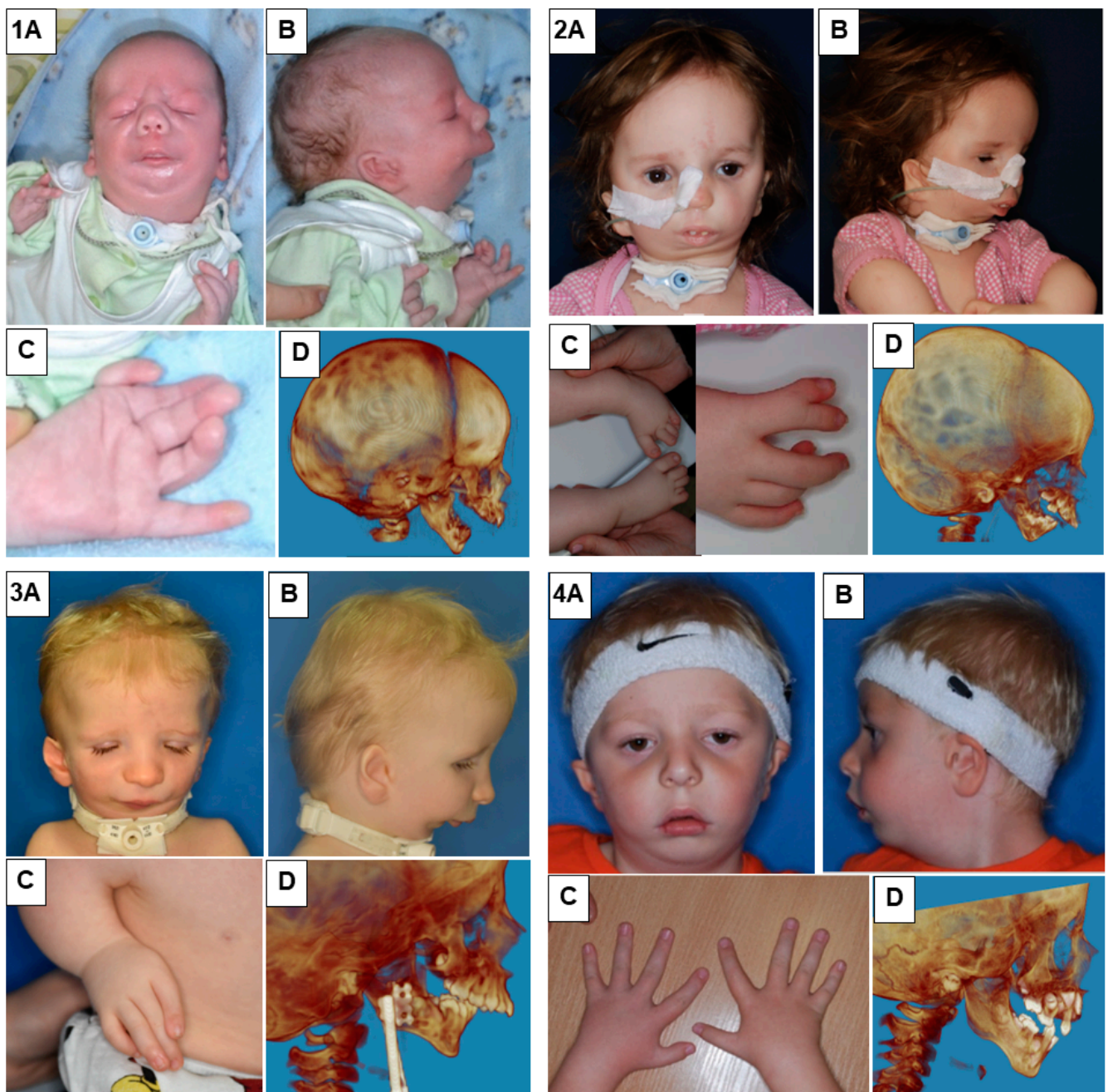
Figure 1. Patients with Nager syndrome: (1) newborn, (2) three years of age, (3) two years of age, and (4) five years of age. (A): front view. (B): lateral view. (C): (1) view of the hand with a vestigial undeveloped thumb, (2) the foot and lower leg with talipes equinovarus (equinus foot) and with abnormal toe structure, (3) the hand with a misaligned and undeveloped thumb as well as characteristic position of the arm due to contracture of the elbow joints and underdevelopment of the bones, and (4) patient with all five fingers on each hand. (D): 3D reconstruction of a CT image lateral projection.