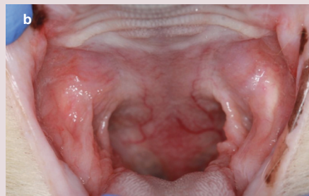
Figure 2 Feline chronic gingivostomatitis (FCGS) before (a) and after (b) administration of allogeneic adipose-derived MSCs (aMSCs). This castrated adult male domestic shorthair cat had a 2 year history of FCGS that was treated with intermittent ciclosporin therapy. Full mouth tooth extractions were performed 1.5 years prior to aMSC therapy. The cat received two doses of allogeneic aMSCs and had substantial clinical improvement within 6 months of therapy. It continued to be in remission at the time of writing 1.5 years later.

– so therapy, if efficacious, appears to be curative (some cats are >4 years out since aMSC infusion). Clinical cure is associated with histopathologic resolution of T and B cell inflammation. The data to date suggest that autologous therapy may be slightly more effective, especially for the most severely affected cats, and that improvement/cure occurs more quickly after autologous cell infusion than after allogeneic cell infusion. 18,35