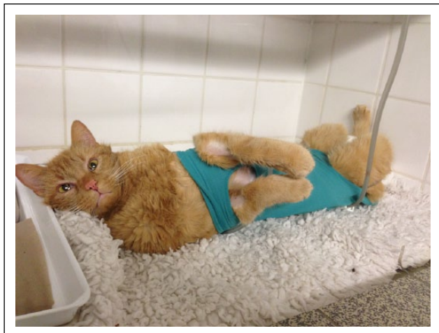
Figure 2 Negative pressure wound therapy was well tolerated by all patients

during the first 3 days after grafting were performed with the patients awake. The grafts showed fast incorporation and granulation. Nine of ten grafts were tightly attached to the underlying tissue and granulation of the meshed incisions had already reached the skin level by day 3 (Figure 1). Fluid accumulation was minor and did not exceed 10 ml during the whole treatment duration in any patient. Vacuum leakage occurred twice in one of the cats owing to the close proximity of the wound to the penis, leaving very little skin for fixation of the NPWT dressing. Leakage was addressed by re-application of the dressing with the patients awake.