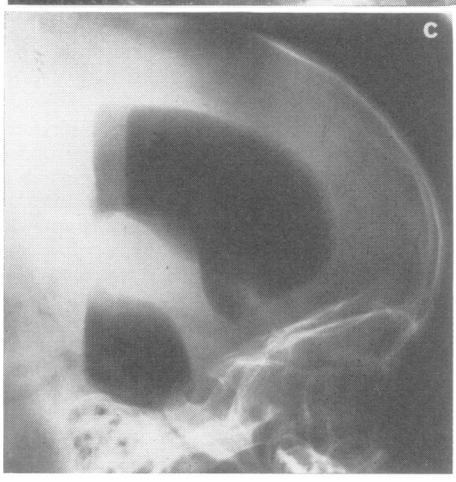
FIG. 1. Pneumoencephalogram. Case 4. Suprasellar cyst. a. Lateral view showing displacement of the 4th ventricle and aqueduct and deformity of the 3rd ventricle due to a suprasellar cyst. Air is seen in the cavum septum pellucidum and dilated lateral ventricles. b. Postero-anterior film corresponding with (a). The wide cavity of the 3rd ventricle is shown indented from below by the cyst. The cavum septum pellucidum is superimposed on the 3rd ventricle. c. Supine lateral film showing deformity of the 3rd ventricle with the cyst projecting into it and into the lateral ventricles.