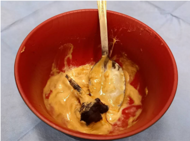
DOI: 10.12998/wjcc.v12.i2.399 Copyright ©The Author(s) 2024.