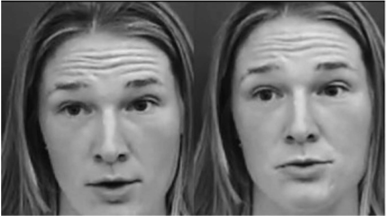
Figure 1: Screen capture from a sample trial of the experiment.