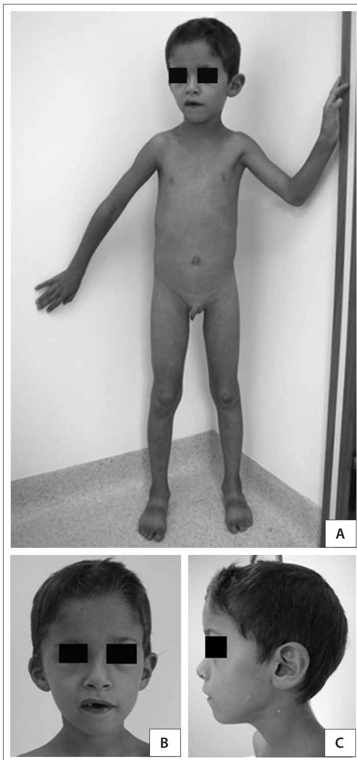
Figure 1. Patient 1: six-year-old boy with mosaic trisomy 9.

prominent forehead, triangular and asymmetrical face (right hemiface was smaller), smooth philtrum, thin lips, deviation of the labial commissure during speech, microtia of the right ear with overfolded helix, diastasis recti, micropenis [penis length of 4 cm (< P10)], small testicles and hallux valgus (Figure 1). He presented a heart murmur, but echocardiography showed normal results.