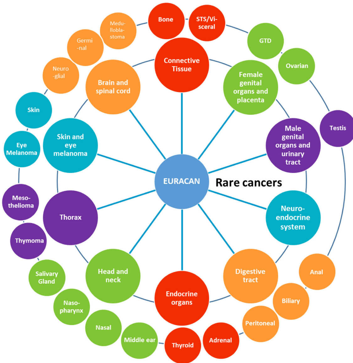
Fig. 1: Cancer groups and subgroups covered by EURACAN.