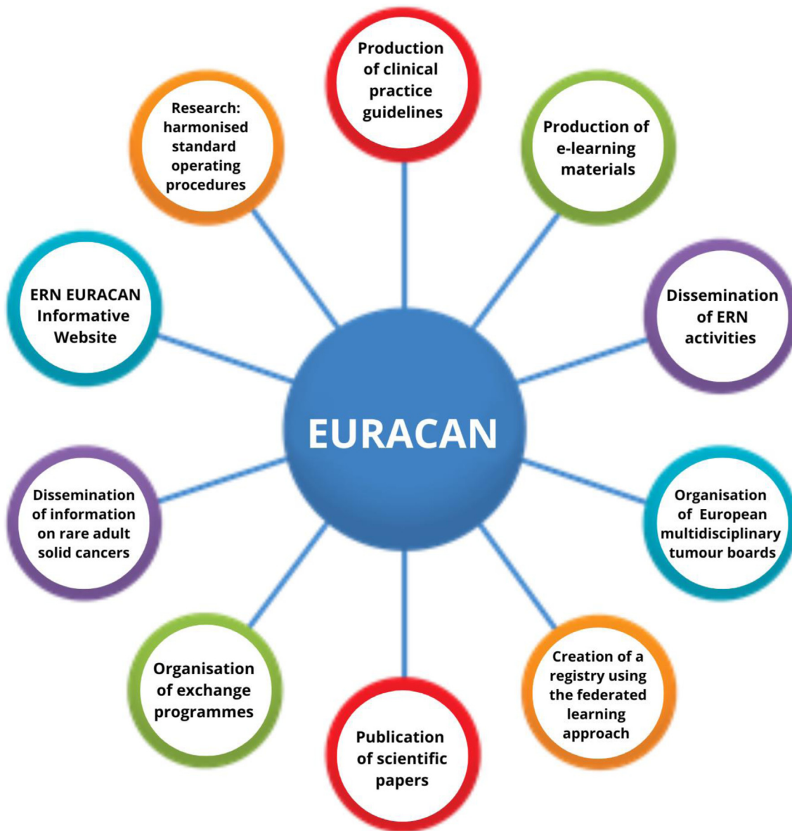
Fig. 2: Graphical abstract of EURACAN activities.

This requires dedicated budget and funding, as human resources in the field of rare cancers are limited in all countries.