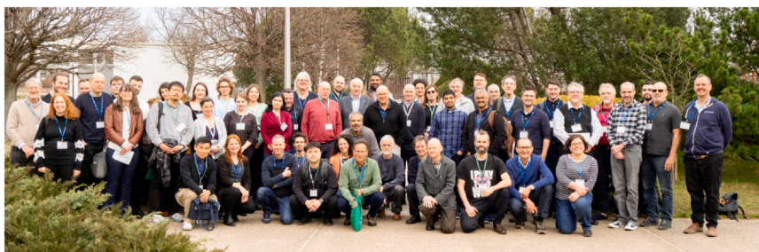
Fig. 1 Group photo.