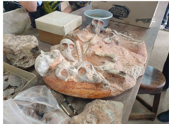
Fig. 3 Delegates visiting “The Shed” on site where they could directly interact with technicians who were delicately extracting recently discovered fossils

of Witwatersrand, Johannesburg. While the meeting emphasized new trends in Cell Death, the meeting began with a “back to the future” themed onsite tour at the Cradle of Humankind, a historical paleoanthropological site near the meeting site, northwest of Johannesburg in the Gauteng province. Meeting participants navigated limestone caves (Fig. 2), where some of the earliest human ancestors, hominin fossil remains were discovered, and they directly interacted with technicians who were delicately extracting recently discovered fossils (Fig. 3). The Gauteng province caves are some of the oldest paleontologist sites on earth and produced some of the most ancient interments of the hominins.