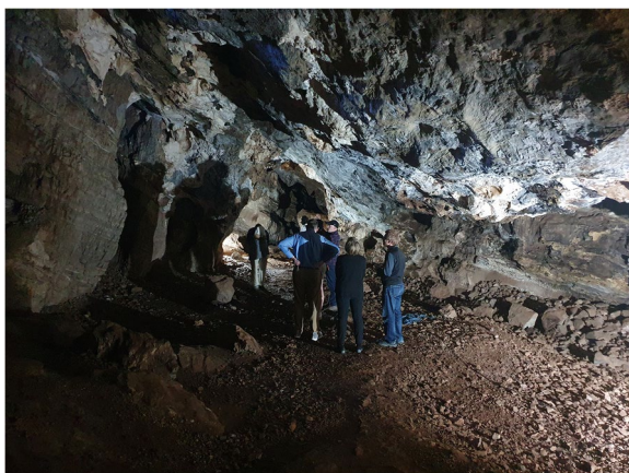
Fig. 2 Meeting participants navigated the Sterkfontein limestone caves in Gauteng Province, where some of the earliest human ancestors, hominin fossil remains were discovered