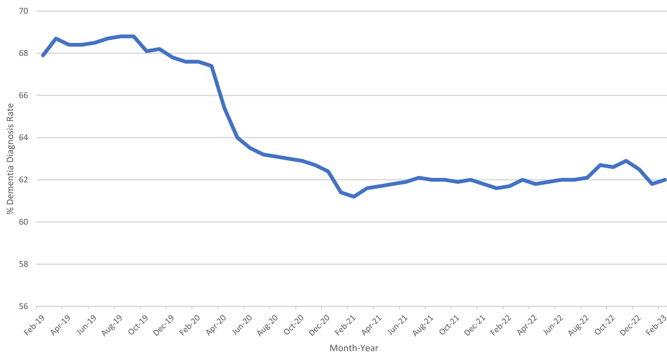
FIGURE 1 Dementia diagnosis rate (DDR) (%) in people over the age of 65 years between February 2019 and February 2023 in England 12 .

The national estimated DDR for England is reported monthly by NHS Digital. 12 The DDR is calculated by dividing the number of people aged over 65 years who have a recorded diagnosis of dementia (from any cause) in each health service region of England, recorded on dementia registers in GP practices in accordance with the Quality and Outcomes Framework guidance (numerator), by the estimated number of people aged over 65 years expected to have dementia in the local population using age- and sex-specific prevalence rates (denominator), multiplied by 100. 13 Since March 2015, 65+ age and sex specific prevalence rates have been taken from the Cognitive Function and Ageing Study. 14 CFAS II, conducted in 2011,