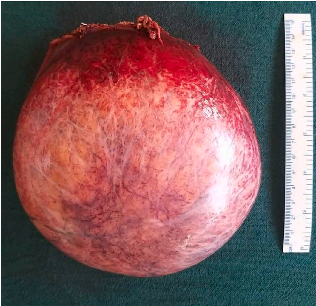
Fig. 2. Gross surgical specimen showing well-demarcated spherical mass measuring 15 cm in diameter.