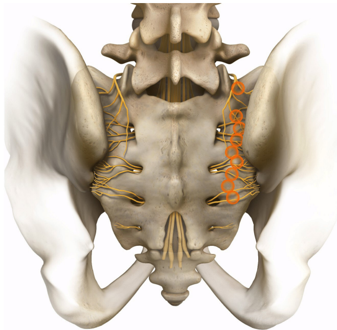
Figure 1 Nine target regions for lateral branch blocks and cooled radiofrequency ablation (CRFA) procedures. The nine target regions (orange circles) were situated around the sacral foramina at the S1–S3 levels and in the groove between the sacral ala and articular process, targeting the dorsal ramus of L5. These targets were used for both the lateral branch block and CRFA procedures (ie, the perforaminal technique).

0–10 NRS pain scores, Oswestry Disability Index 2.1 (ODI) which assesses back pain-related disability, 36-Item Short Form Survey (SF-36) physical function domain, and EuroQoL-5 (EQ-5D-5L) which measures quality of life in five dimensions. 26,27 These self-reported outcomes were reassessed at each follow-up visit, which occurred 1 and 3 months post-treatment. Concomitant medications, healthcare utilization, concurrent interventions and adverse events were assessed at each visit, as was patient satisfaction using the Patient Global Impression of Change (PGIC) scale, a 7-point Likert scale in which higher numbers indicate greater improvement. 27 The primary outcome measure was mean reduction in average NRS pain score at 3 months.