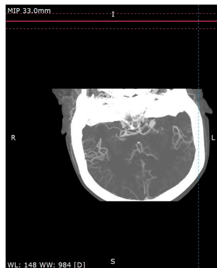
Figure 3. Cerebral CT angiography.