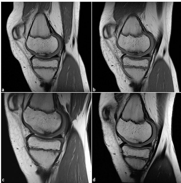
Fig. 3 T1-weighted turbo spin echo sequences (T1-TSE) follow-up MR images in the sagittal plane of osteochondrosis dissecans of the left knee joint of twin 2 after (a) first clinical presentation, (b) three months, (c) seven months and (d) 12 months. The cartilage cover is intact at all times, the defect size is significantly reduced over time and the bone structure appears almost completely regenerated in the last MRI