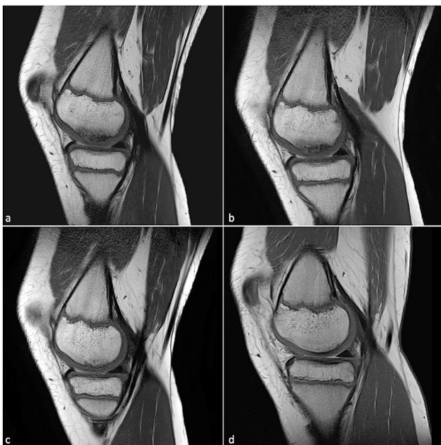
Fig. 1 T1-weighted turbo spin echo sequences (T1-TSE) follow-up MR images of osteochondrosis dissecans of the right knee joint of twin 1 in the sagittal plane: from the stage at the onset of symptoms a ), there is a decrease in lesion size and perifocal edema after b ) six months and c ) fourteen months until complete consolidation of the lesion under conservative treatment after d ) two years of follow-up. There is a decrease in reactive cartilage thickening with a continuous cartilage surface

Left knee joint: There was a 12×25 mm OCL at the medial femoral condyle with minimal adjacent marrow edema and subchondral demarcation with a continuous bone cover. In addition, Osgood-Schlatter disease was diagnosed. Four follow-up images were taken in a period of twelve months after the initial diagnosis and showed a defect in consolidation, which was still covered entirely by cartilage and showed no signs of detachment. The lesion was almost completely consolidated in the last picture (Fig. 3).