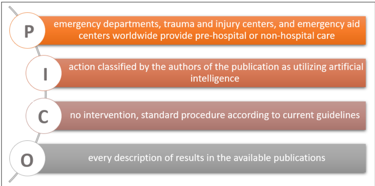
Figure 2: PICO framework of the study.