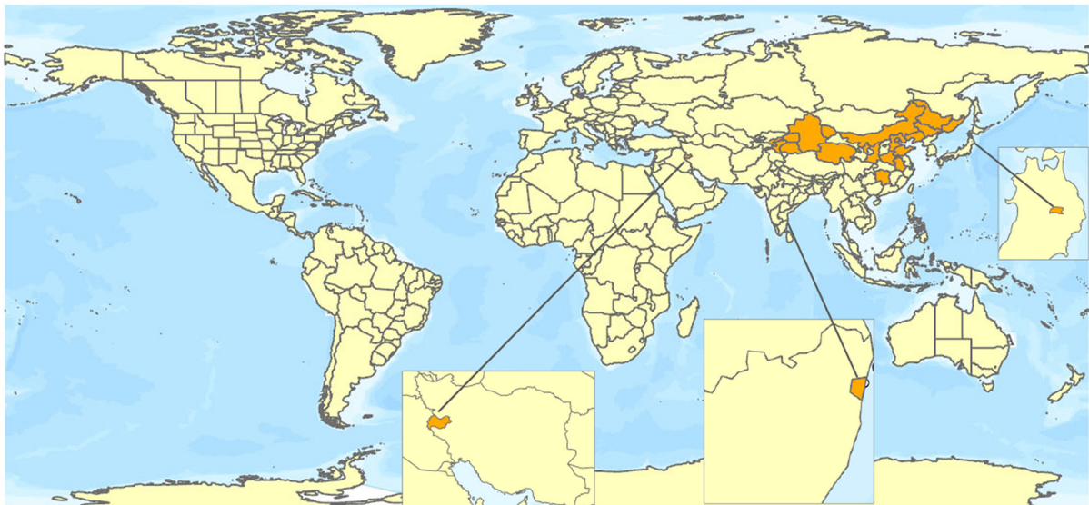
FIGURE 1 Global distribution of Eulecanium giganteum (data source: Deng et al., 2016; García Morales et al., 2016; Kondo & Watson, 2022; Suganthi et al., 2022). The polygons with highlighted orange colour indicate the administrative areas where E. giganteum is present.

E. giganteum is an Asiatic species first described in Morioka, Japan (García Morales et al., 2016). Its present known distribution includes most of northern China, India, Iran, Japan and eastern Russia (Primorsky Krai) (García Morales et al., 2016; Deng et al., 2016; Kondo & Watson, 2022; Suganthi et al., 2022; see Figure 1).