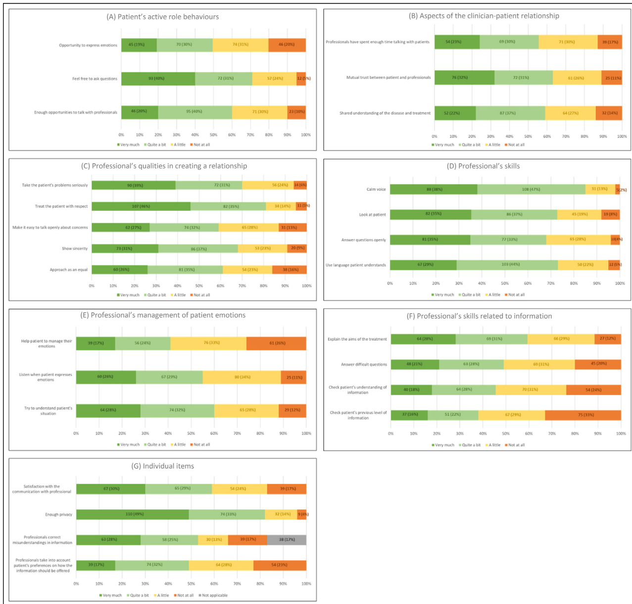
Fig. 1 – Results for (A) patient-initiated communication behaviours, (B) aspects of the clinician-patient relationship, (C) professional's qualities in creating a relationship, (D) skills of professionals, (E) management of patient emotions by professionals, (F) skills of professionals in delivering information, and (G) the four individual items not included in the six scales.

communication with their professional. Approximately half of the respondents (121, 53%) reported that if they did not understand something, it was explained by the clinician. Less than half were asked how they prefer to take part in discussion (113, 49%); in other words, their preference regarding how the information should be shared was not considered. Only nine respondents (4%) felt they did not have enough privacy, whereas 184 (82%) were satisfied with the level of privacy during the treatment pathway (Fig. 1G).