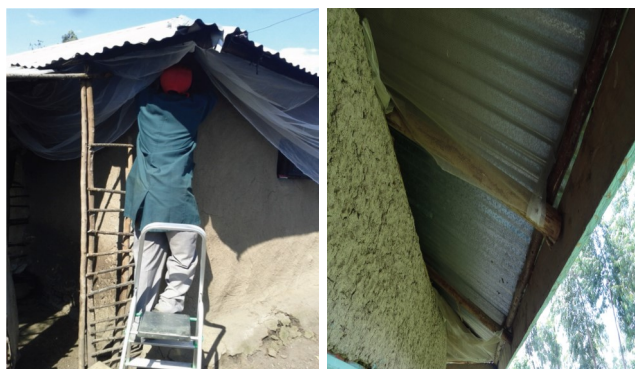
Figure 1. Installation of eave netting under the roof. Figure 2. Model house with fitted eave netting.