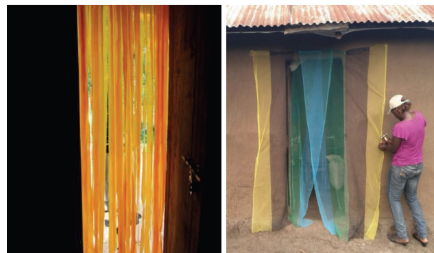
Figure 3. Insecticide-treated door lamellae. Figure 4. Overlapping pieces of LLIN material to prevent house entry by mosquitoes.

close wood frames covering windows and thus assure that the curtains remained in place based on personal observations by one of the authors from earlier net curtain project in Burkina Faso, where nets were fixed to the walls and released by the inhabitants (though the authors of the paper never mentioned so). Two different models of door hangers were used: 0.5 mm thick laminate of low density polyethylene with incorporated deltamethrin (referred to as laminated door streamers), cut at the factory into 7 cm wide stripes except at the top (Figure 3), or polyethylene nets made from the same material as the eave nets, both delivered by IIC. When laminated door streamers were used, a double layer of two pieces of 100 cm width were fixed to cover the doorway in the way the lamels on one layer covered the cuts of the other. For the polyethylene nets, two overlapping pieces of net were hung from above the doorway (Figure 4). In the control houses only LLINs were suspended above all sleeping places.