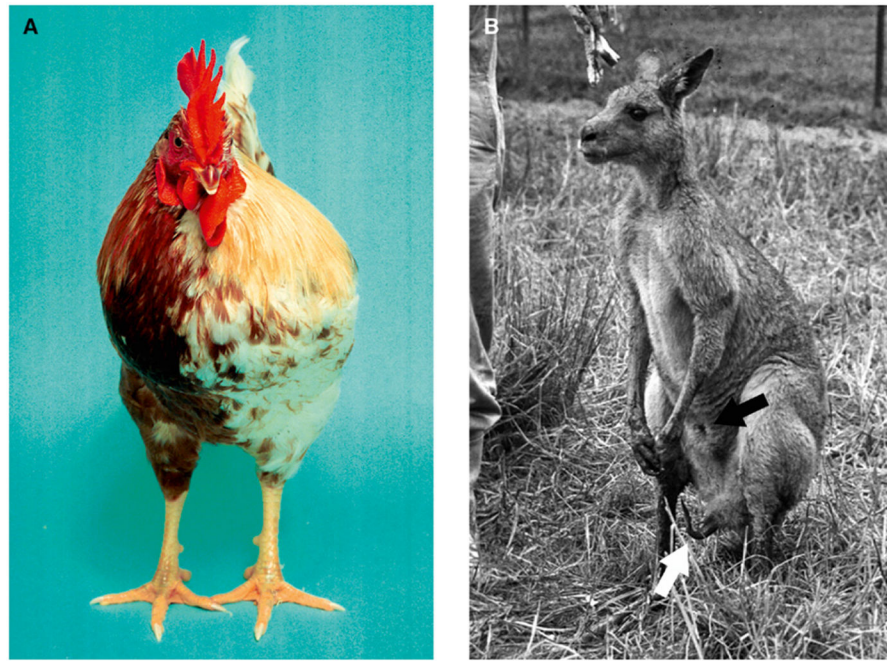
Figure 3. Animals of mixed-sex genotypes showing both male and female sexual traits. (A) Bilateral gynandromorph chicken. Right side has cells that are predominantly ZW, while left side cells are predominantly ZZ. Consequently, female characteristics, e.g. small wattle and small leg spur, are expressed on the bird's right side (brown plumage) while male characteristics, e.g. large wattle, large leg spur and greater muscle mass, are expressed on the bird's left side (gold and white plumage). (B) "Vincent", an XXY gray kangaroo ( Macropus giganteus ) showing both male and female characteristics. The black arrow indicates the pouch, which is determined by the number of X chromosomes, while the white arrow indicates the penis, which along with the testes is determined by the presence of a Y chromosome.