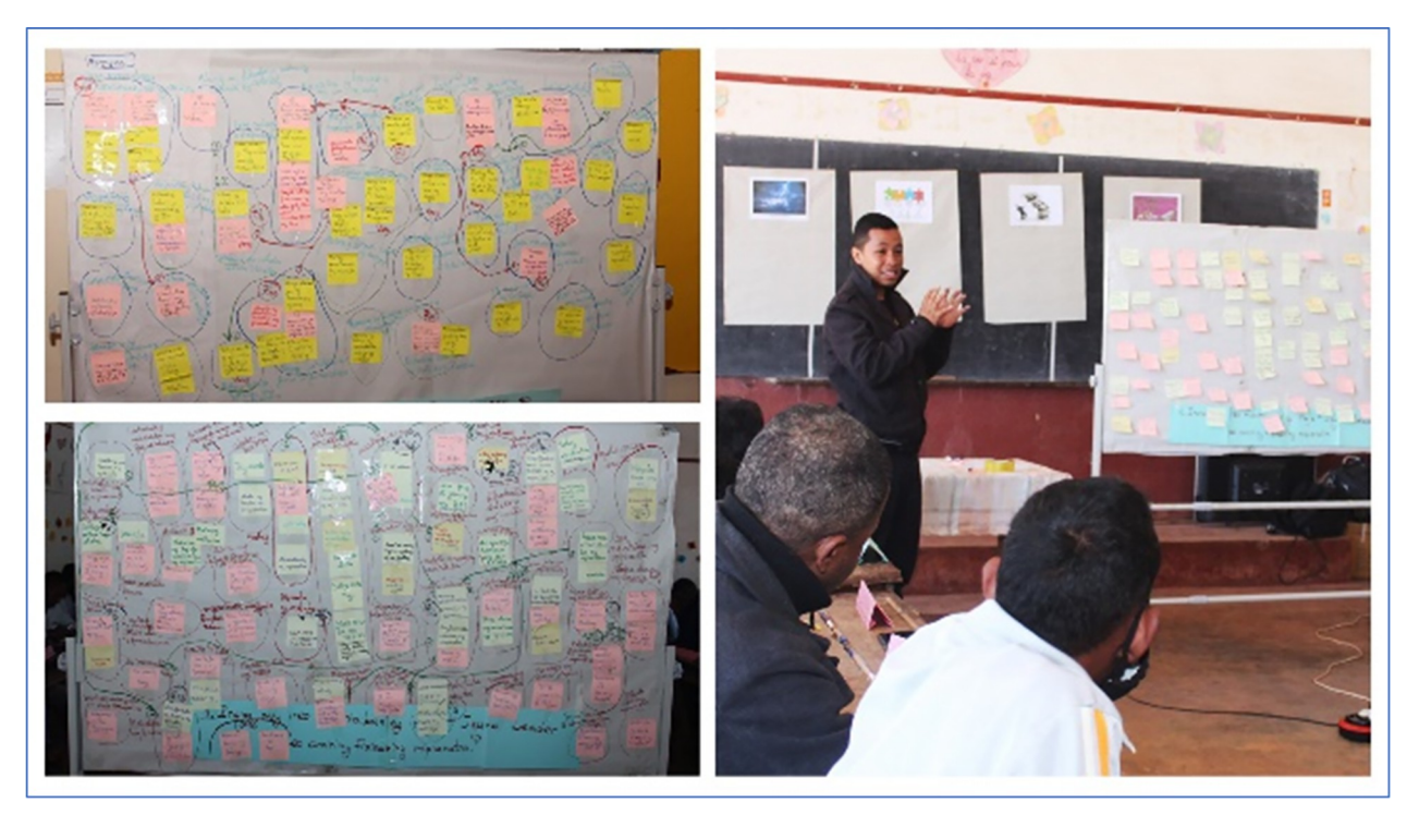
Fig 2. The facilitator led participants in a brainstorming and affinity clustering exercise regarding the research prompts.

https://doi.org/10.1371/journal.pone.0297106.g002