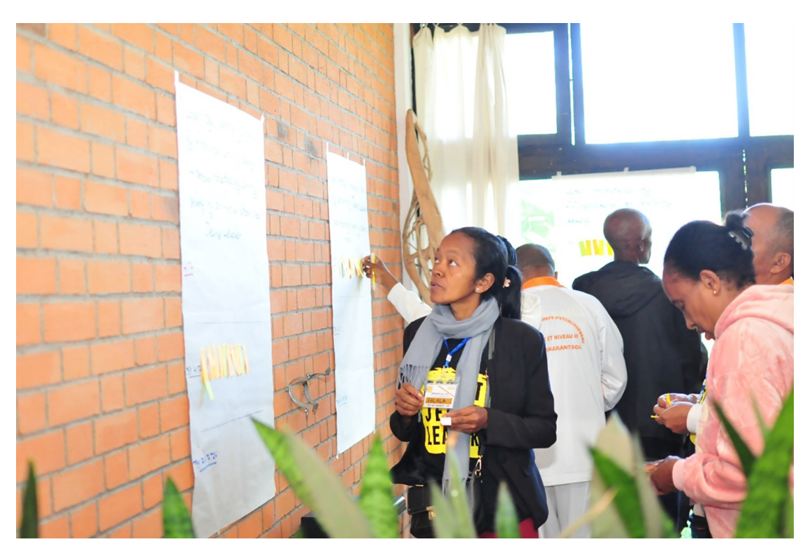
Fig 1. A participating principal reads the cluster label. The flipchart had three sections to vote on: "Have seen (this impact)," "Have not seen," and "Don't know".

https://doi.org/10.1371/journal.pone.0297106.g001