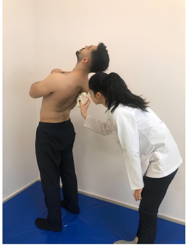
Figure 3. Maximum extension position.