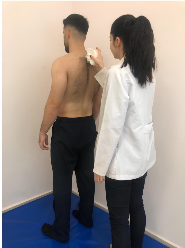
Figure 1. Upright position.

effect size (d) of the study was calculated as 1.37 as a result of the calculation carried out using TIS total data in which the total number of samples was 76, and the power of the study ( 1 - \beta ) was calculated as 0.99 with a 5% margin of error ( \alpha = 0.05 ). For statistical analyses, SPSS 22.0 (SPSS Inc., Chicago, USA) was used. The Statistical Package for Social Sciences (SPSS) Version 20 statistical program was used for statistical evaluation of the data. Data normality was tested using the Shapiro-Wilk test. Mean and standard deviation are used to represent normally distributed data, and median (IQR25-75) is used to represent nonnormal distributed data. Gender variables are expressed as frequency and percentage (%). The chi-square test was used to assess the difference between the groups in terms of sex. Intergroup differences were analyzed with the Independent Samples T-Test and Mann-Whitney U Test. The association between the variables in the PwMS group was determined using Spearman and Pearson correlation analysis. Statistical significance was set at \alpha < 0.05 . The findings of the correlation analysis were divided into five categories: 0.81–1.00 (very good correlation), 0.61–0.80 (good correlation), 0.41–0.60 (moderate correlation), 0.21–0.40 (fair correlation), and 0.00–0.20 (poor correlation).