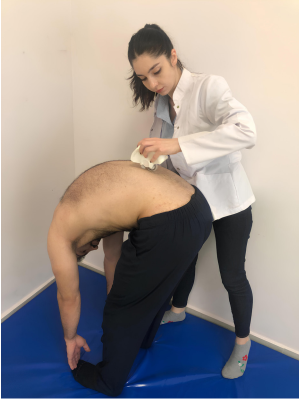
Figure 2. Maximum flexion position.