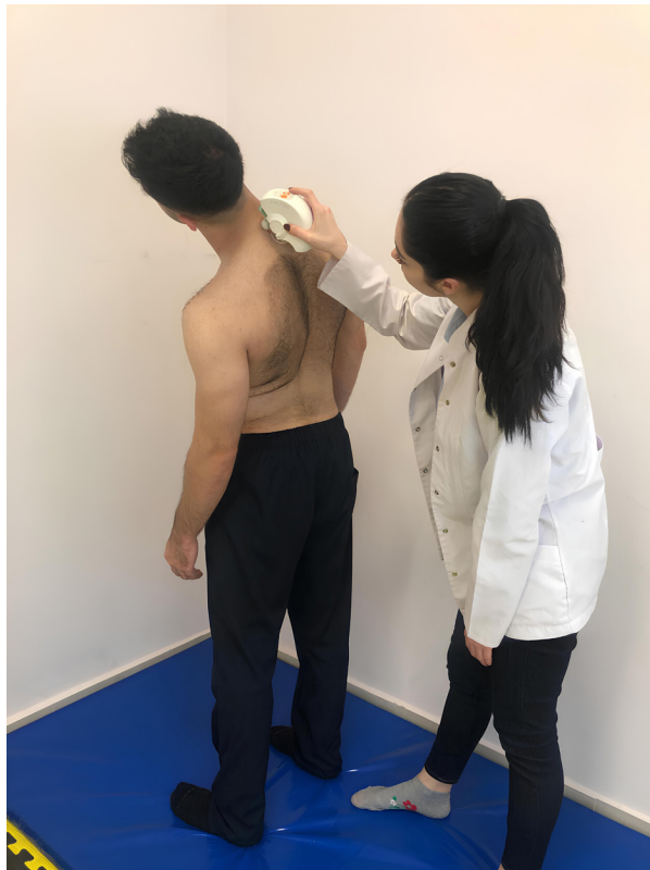
Figure 4. Maximum left lateral flexion position.