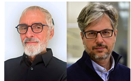
Insights from Nicholas P. Restifo and Luca Gattinoni.

T cell immunotherapy has deepened our understanding of the qualities of cells that are highly effective at triggering tumor destruction (Fig. 1). T cell infusion products comprised of cells with stem-like qualities generally yield better patient responses compared to those enriched in mature T cells (Fraiteta et al., 2018; Krishna et al., 2020). These results confirm observations made in wild-type mice and humanized mouse models showing that each T cell clonotype can behave like an adult stem cell system, capable of repeated cell divisions and giving rise to more specialized cells, while also renewing themselves (Gattinoni et al., 2009, 2011). These T cells resemble adult stem cells, capable of multiple divisions and evolving into specialized cells while self-renewing. T memory stem cells (T SCM ) are vital for genetic integrity throughout life, akin to adult stem cells'