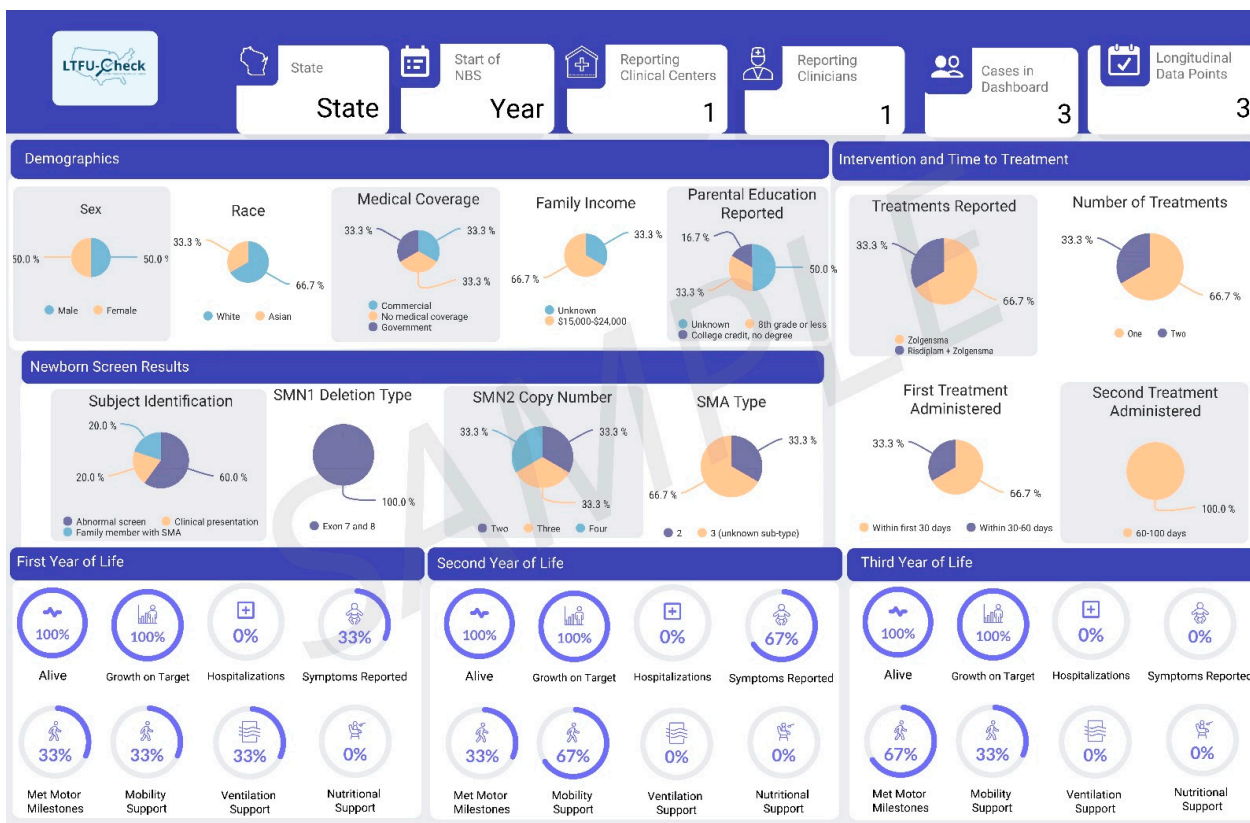
Figure 4. Sample dashboard for state NBS programs.