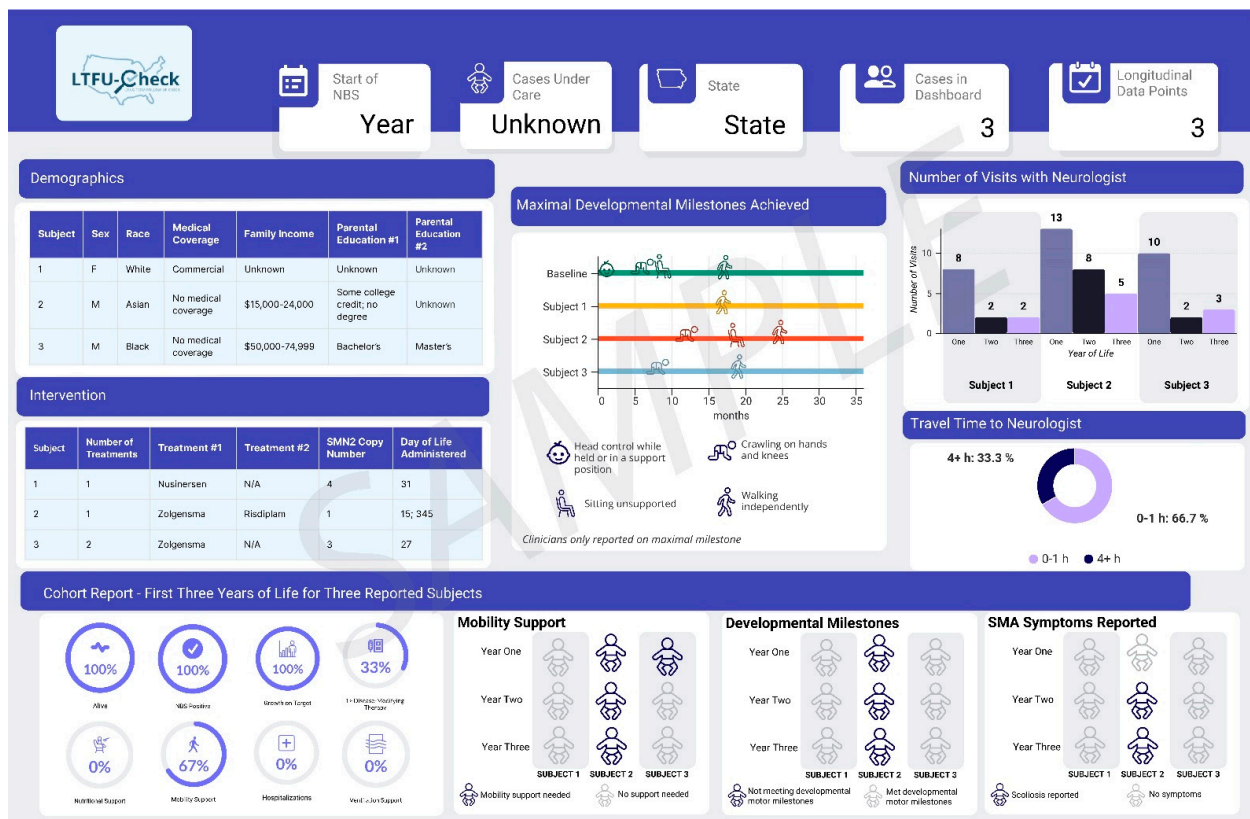
Figure 3. Sample dashboard for clinical sites.

Results from the LTFU-Cares Dashboard showcase case-level data tailored to pediatric neurologists (Figure 3) and state-level data for the respective states (Figure 4). Each dashboard is customized based on the data collected from LTFU-Cares. The design of the dashboard was shaped by collaborative consultations with clinicians who provided input on the information they wanted featured in the dashboards. All clinicians (100%) emphasized the importance of including maximal motor milestones achieved over time, a feature tailored to help them assess if cases were on target, as shown in the middle of Figure 3. Additionally, clinicians expressed a need to include detailed information on the timing of treatment from the NBS result on state dashboards, which is shown on the right of Figure 4. Key information, including demographics, newborn screening results, and cohort reports, were included in both dashboards.