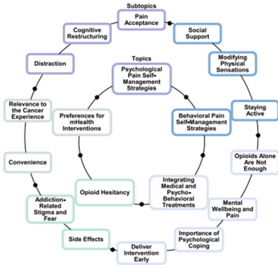
FIGURE 3. Primary topics identified in qualitative, semi-structured interviews with patients with advanced cancer and pain reflecting on their experiences self-managing pain and using mHealth apps for pain management support.