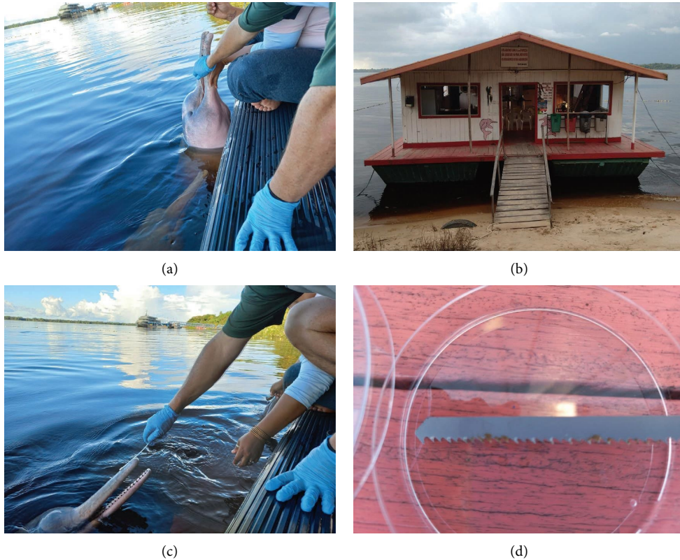
FIGURE 2: Images of sample collections ( Inia geoffrensis ). Collection of swabs from oral cavity from the boto “Curumim” (a); floating facility where the interaction with Amazon River dolphins occurred (b); collection of a skin sample from “Chico” (c); and small saw used to generate greater friction with the skin of dolphins (d).