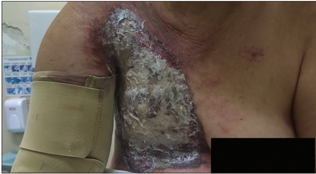
Figure 3: Large thoracic ulcer being treated with topic metronidazole for approximately 1 month before symptoms occurred

clinical information to be reported in the journal. The patients understand that their names and initials will not be published and due efforts will be made to conceal their identity, but anonymity cannot be guaranteed.