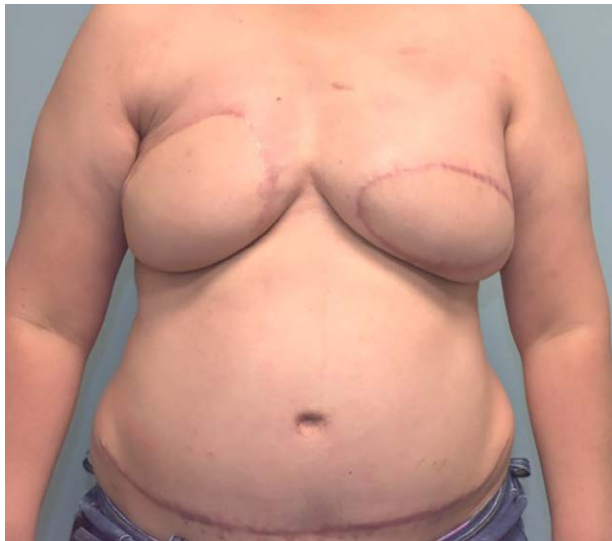
Fig. 4. Postoperative photographs at 12 months following bilateral DIEP flap breast reconstruction salvaged with a cross-thoracic saphenous vein graft.