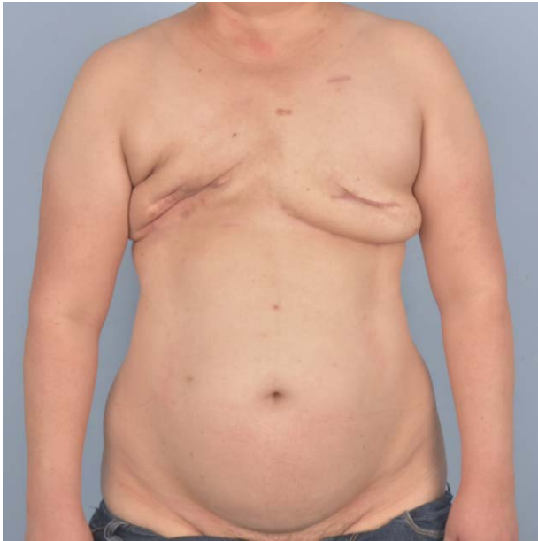
Fig. 1. Preoperative photograph of the 47-year-old woman following bilateral skin-sparing mastectomy with right sentinel lymph node biopsy.

conduit to reach the unused right lateral IMV, which was of adequate caliber to provide antegrade venous drainage from the congested left-sided flap. The saphenous vein was harvested, and a presternal subcutaneous tunnel was developed to pass the vein graft from the left to the right flap recipient site. To maintain patency of the graft itself, the adipose layer was cored out until it was wide enough to ensure that the graft would be both tension and compression-free yet narrow enough to prevent a contour deformity or symmastia. Coupled end-to-end anastomoses were performed between the flap vein and vein graft (3-mm coupler), and between the vein graft and the right lateral IMV (2.5-mm coupler; Fig. 2). (See figure, Supplemental Digital Content 1, which displays inseting of the DIEP flaps following saphenous vein graft anastomoses. http://links.lww.com/PRSGO/D216 .) There was no immediate