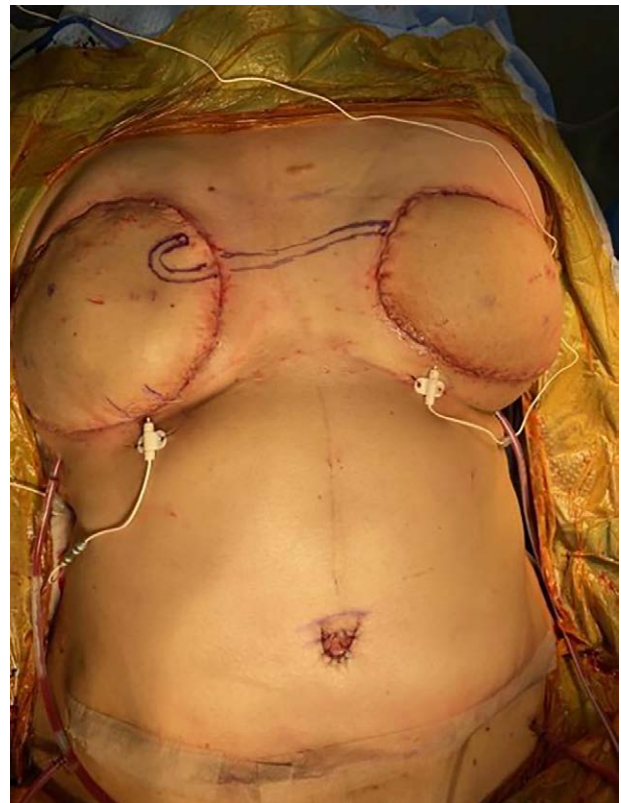
Fig. 3. With the patient in supine position, there is a lack of immediate venous congestion following flap inseting.

or delayed venous congestion noted, and both flaps demonstrated adequate perfusion and drainage (Fig. 3). An implantable venous Doppler was placed to monitor flap viability in the postoperative period. The patient's immediate postoperative course was uncomplicated, with reassuring flap skin paddle appearance and Doppler signals bilaterally. She was discharged unremarkably on postoperative day 4 and continues to do well over 6 months and 1 year after her reconstruction (Fig. 4). She has since undergone revision for asymmetry with fat grafting to the right radiated reconstructed breast and reduction/uplift of the left flap.